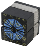
CX BG™ module with Multidiameter™