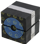
CX module with Multidiameter™